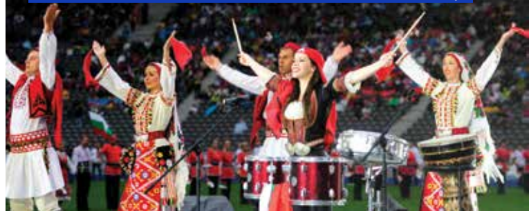
World Culture Festival (2011), Berlin, Germany

Showcasing the rich cultural traditions of dance, music and the arts from around the world as well as Yoga, the Festival hopes to foster a deeper understanding between people of different faiths, nationalities and backgrounds.