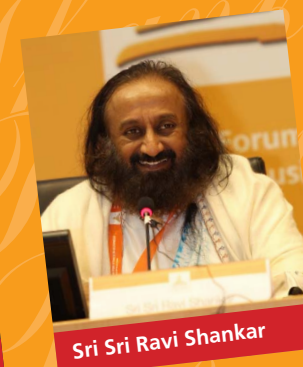
Sri Sri Ravi Shankar