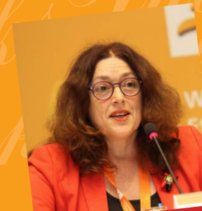
Dr. Monika Griefahn