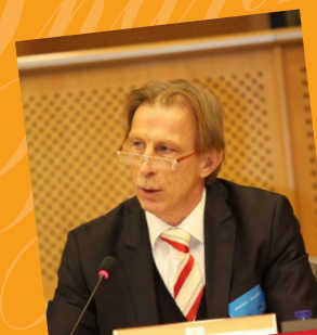
Mr. Christoph Daum