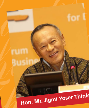
Hon. Mr. Jigmi Yoser Thinley