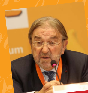
Prof. Herman de Croo