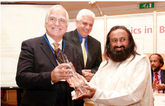
Outstanding Individual Award, 2007 Winner, Prof. Dr. Peter Eigen, Founder of Transparency International

We honour individuals and companies that have demonstrated the importance of human values as well as ethics in life and business.