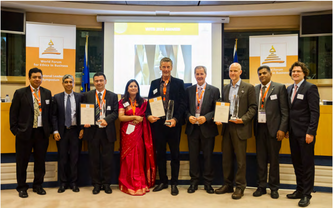
2013 WFEB Award Winners with the WFEB Board Members and Executive Team