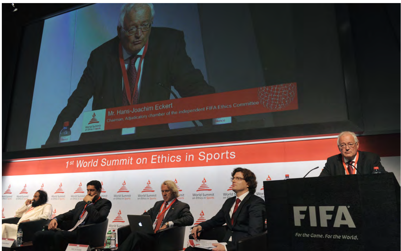
World Summit on Ethics in Sports 2014, FIFA Headquarters, Zurich, Switzerland Inaugural Panel.