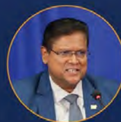
H.E. Mr. Chandrikapersad Santokhi

Prime Minister of the Republic of Slovenia