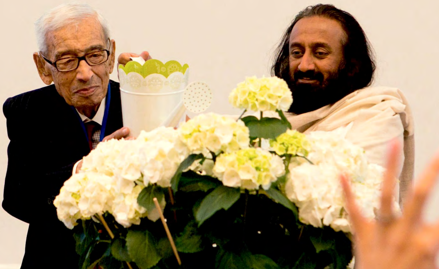
Top: Former Secretary-General of the UN, H. E. Boutros Boutros-Ghali, with WFEB Founder, H. H. Sri Sri Ravi Shankar at the WFEB Conference at the UN Headquarters, Geneva, 1 July, 2013

For the whole to be more than the sum of the parts, good teamwork, trust and mutual partnership is the key. The WFEB looks back to sixteen years of collaborative leadership and strong strategic partnerships.