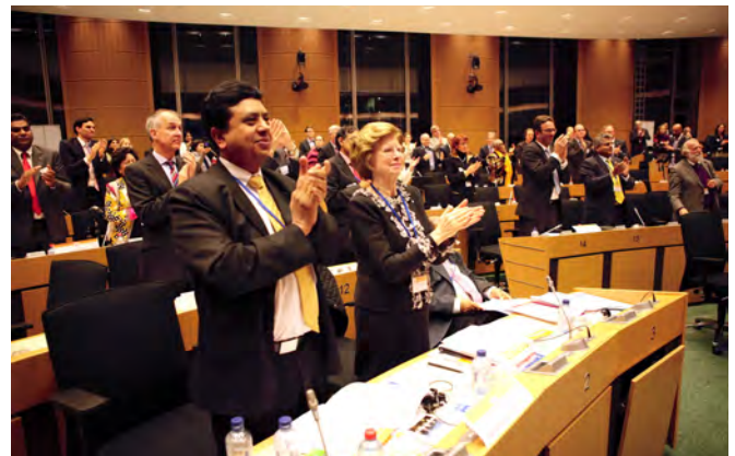
International Leadership Symposium 2012, European Parliament, Brussels