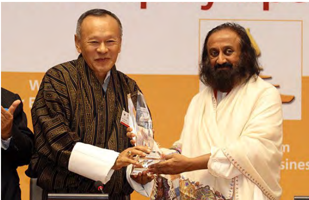
Outstanding Individual Award 2015 winner, H. E. Lyonchen Jigmi Thinley, Former Prime Minister of Bhutan