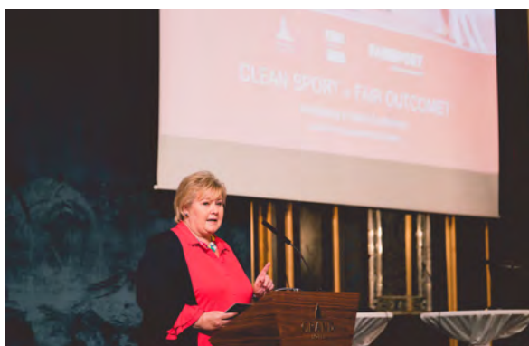
Norway's Prime Minister Erna Solberg inaugurated the conference

Speaking up for anti-doping, WFEB in 2018 teamed up with Anti-Doping Norway and FairSport for the "Anti-Doping in Sports" conference in Oslo, another edition in the ethics in sports conference series, which will see its continuation in 2019 as well. Global experts in the anti-doping world met on 25 June 2018 during the '1st Anti-Doping in Sports Conference' in Oslo, seeking for alternatives and valuable inputs to protect clean sports and athletes. The conference was opened by Norway's Prime Minister Erna Solberg.