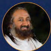
Gurudev Sri Sri Ravi Shankar

Founder, World Forum for Ethics in Business; Founder, The Art of Living Foundation