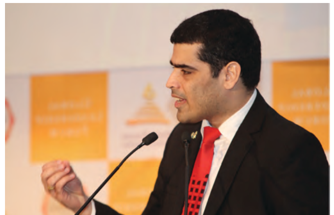
Mr. Michael Ashwin Satyandre Adhin, Vice President of the Republic of Suriname