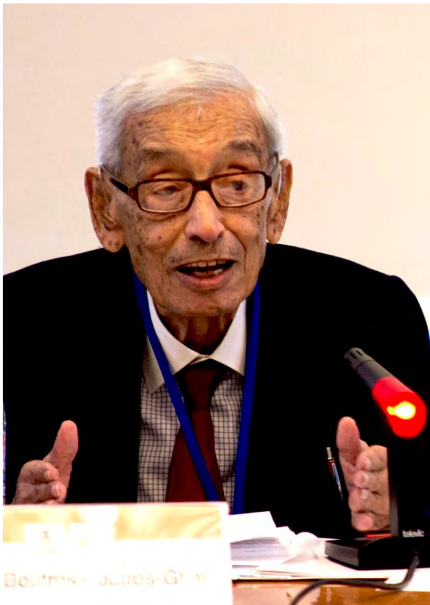
H. E. Boutros Boutros-Ghali, Former United Nations Secretary-General, at the WFEB Conference, 1 July 2013, UN Headquarters, Geneva