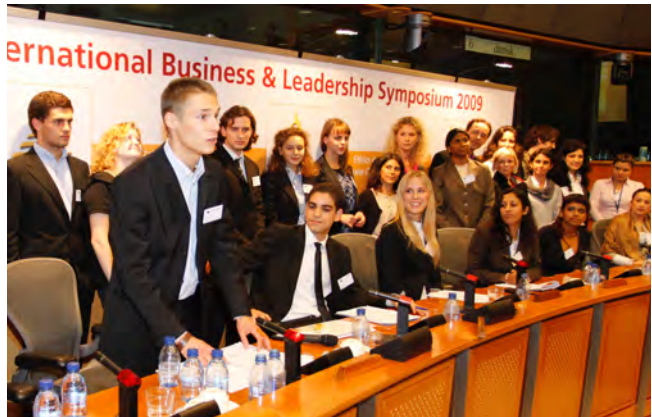
World Youth Forum 2009 assembly