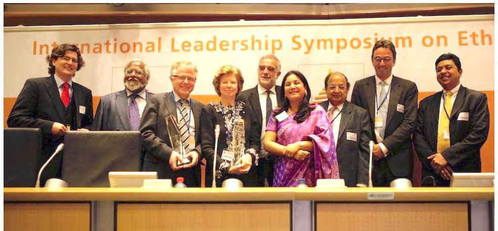
WFEB Award winners 2012 pose with WFEB Board Members & Executive.