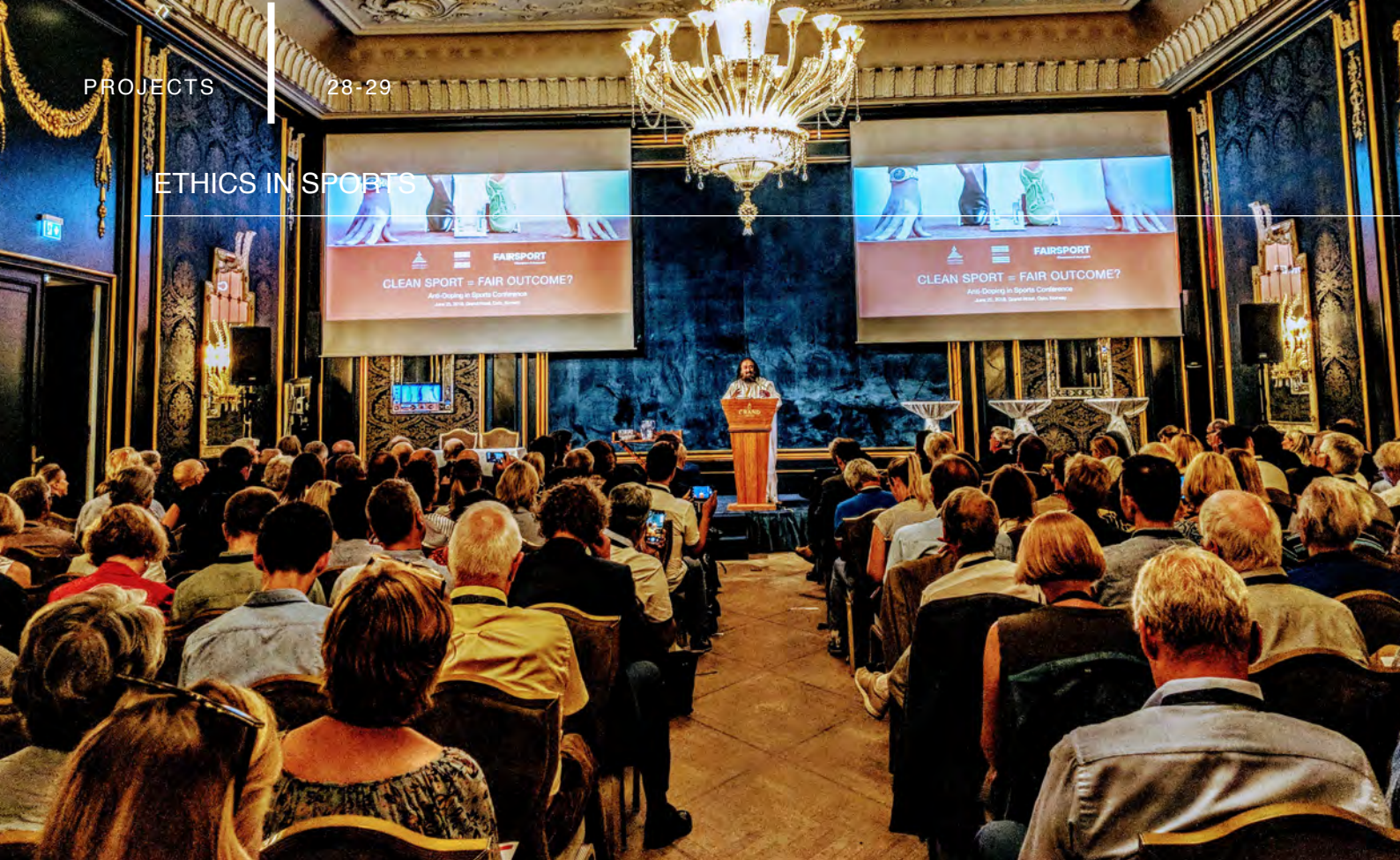
WFEB founder Sri Sri Ravi Shankar addresses the 1st Anti-Doping in Sports Conference in Oslo