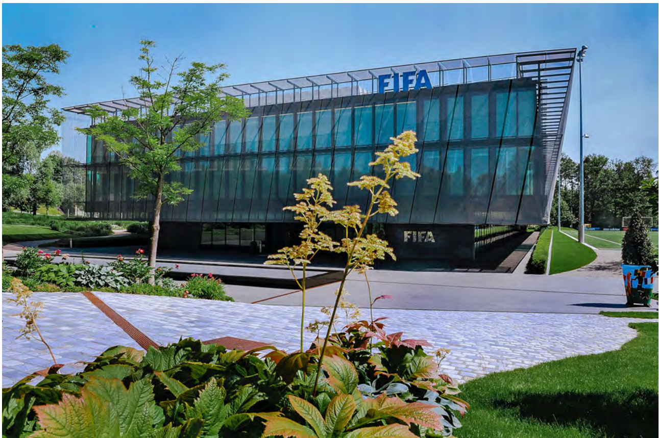
FIFA Headquarters, Zurich

The 1st World Summit on Ethics in Sports was held on 19 September 2014, at the home of the international football community federation, the FIFA Headquarters. This impressive looking