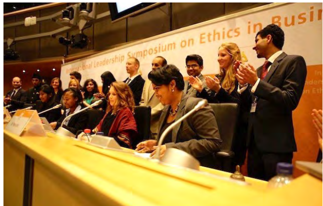
World Youth participants 2010