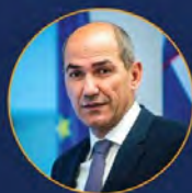
H.E. Mr. Janez Janša

Director-General, World Health Organization