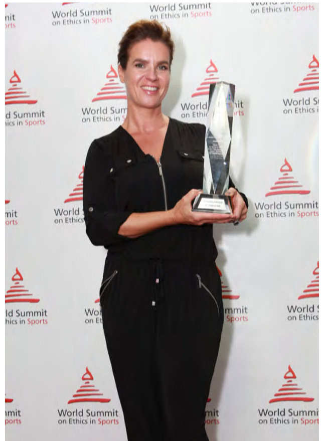
Ms. Katarina Witt, Outstanding Individual Ethics in Sports Award recipient