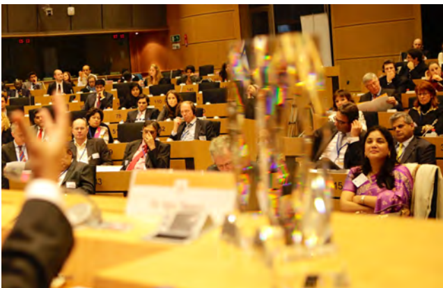
International Leadership Symposium 2012, European Parliament, Brussels