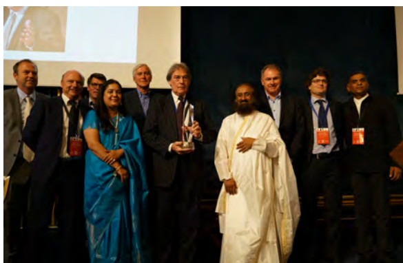
The leadership of WFEB, Anti-Doping Norway and FairSport with the 2019 WFEB Ethics in Sports Award winner David Howman

Speaking up for anti-doping, WFEB in 2018 teamed up with Anti-Doping Norway and FairSport for the "Anti-Doping in Sports" conference in Oslo, another edition in the ethics in sports conference series, which will see its continuation in 2019 as well. Global experts in the anti-doping world met on 25 June 2018 during the '1st Anti-Doping in Sports Conference' in Oslo, seeking for alternatives and valuable inputs to protect clean sports and athletes. The conference was opened by Norway's Prime Minister Erna Solberg.