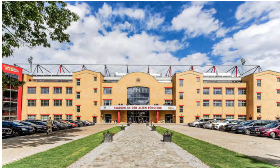
Outside of the An der Altern Foresterai stadium, Berlin

stadium served as host to the 24 September 2015 Ethics in Sports Symposium Berlin. The home of the 1.FC Union Berlin football club exhibits uniqueness of team spirit: more than 2,300 Union fans invested 140,000 labour hours to renovate their stadium, and 27,500 fans and guests sing Christmas carols as part of an annually growing event.