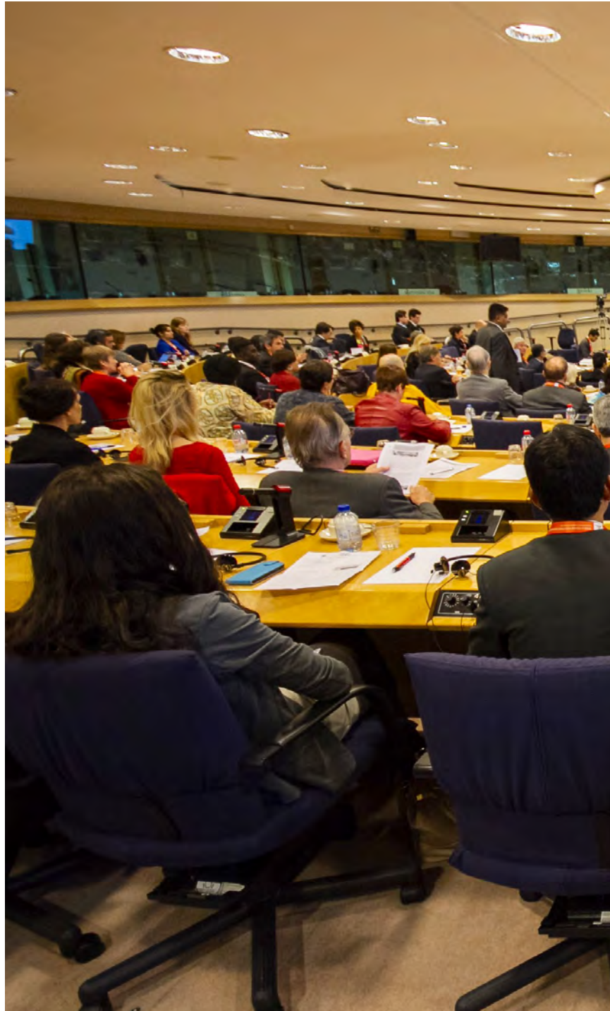
European Parliament, Brussels: International Leadership Symposium venue since 2006

The organisation also aims to provide participants with a wide range of tools that can empower them personally as leaders, recognising that paradigm shifts in society are based on individual transformation.