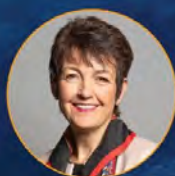
Hon. Ms. Jo Churchill

Former Prime Minister of Norway, Founder & Executive Chair, The Oslo Center