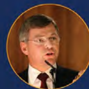
Hon. Mr. Kjell Magne Bondevik

Deputy Prime Minister and Minister of Civil Service, Belgium