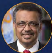
Hon. Dr. Tedros Adhanom Ghebreyesus

Founder, World Forum for Ethics in Business; Founder, The Art of Living Foundation