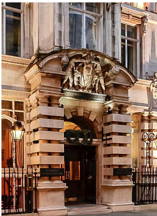
Moorgate Place, ICAEW Headquarter, London – Courtesy of ICAEW

On 1 July 2013, the WFEB International Leadership Symposium took place at the United Nations Geneva, Switzerland, at the historic Palais des Nations overlooking the lake of Geneva. The Palace is architecturally designed to preside and to hold discussions in the calm atmosphere which should prevail when dealing with problems of an international dimension. The Palace and its buildings constitute the second-largest building complex in Europe, after Versailles.