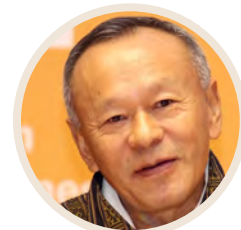
MR. JIGMI YOSER THINLEY

We need a wise and ethical vision that will bring all of humanity together. Such a vision must arise from an understanding of what constitutes development, personal wealth and societal prosperity in the human context.