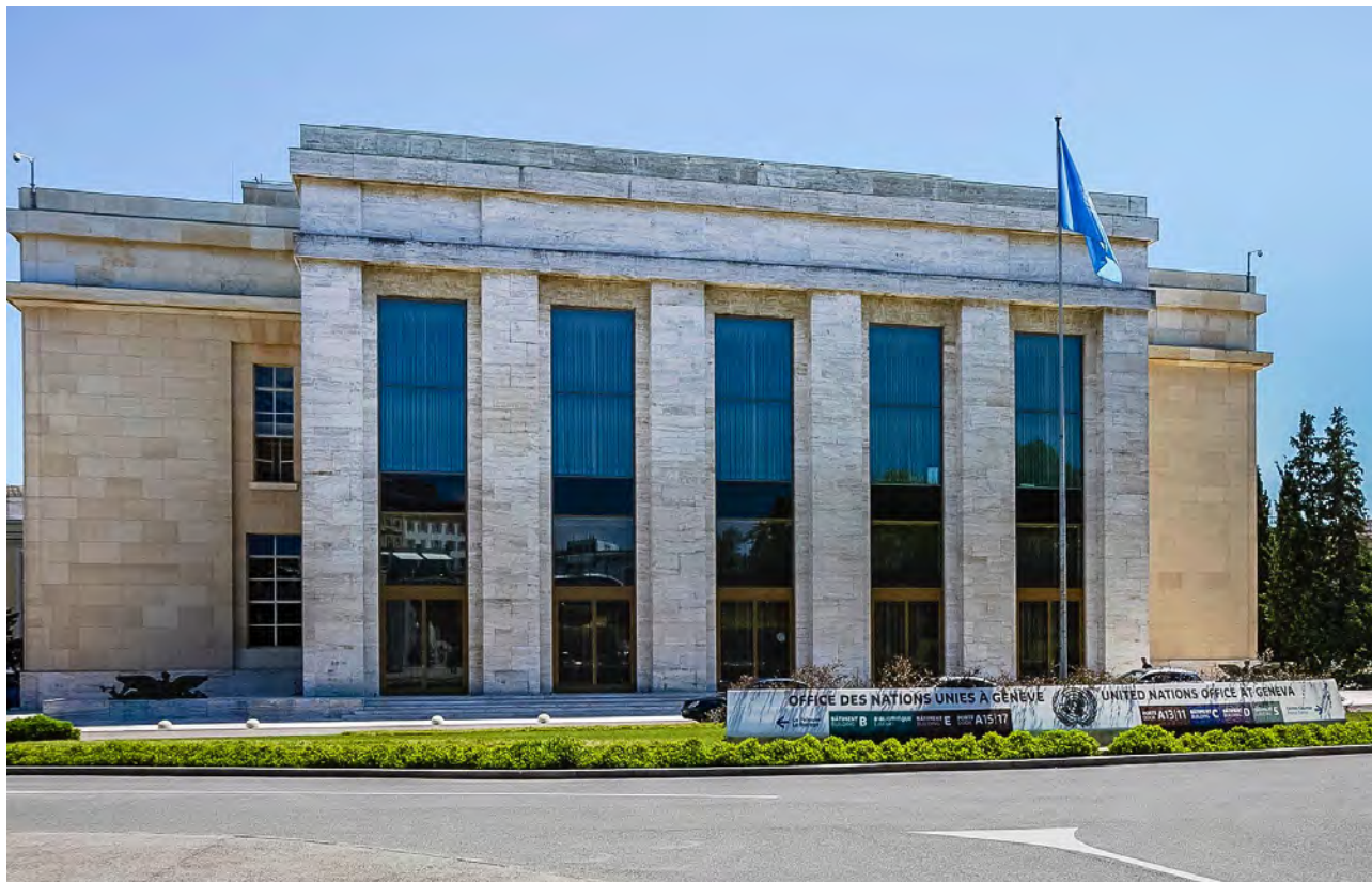
Palais des Nations, United Nations Geneva, Switzerland