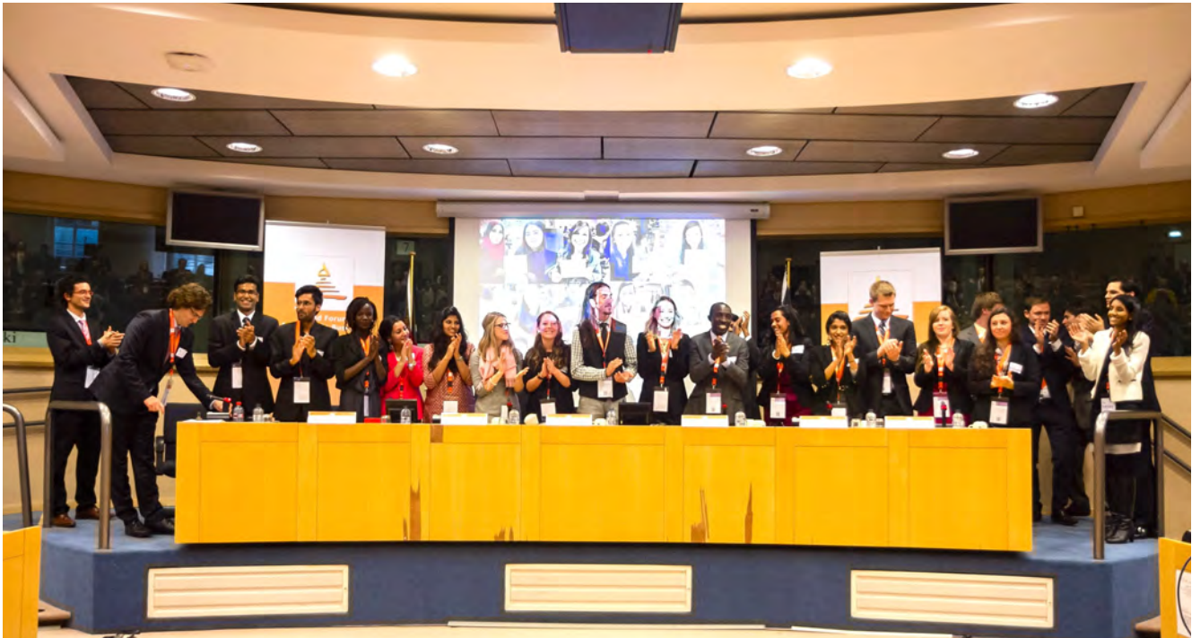
Call of the youth at the European Parliament, Brussels, 2013