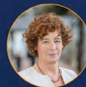
Hon. Prof. Petra de Sutter

Deputy Prime Minister and Minister of Civil Service, Belgium